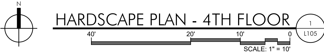
HARDSCAPE PLAN - 4TH FLOOR